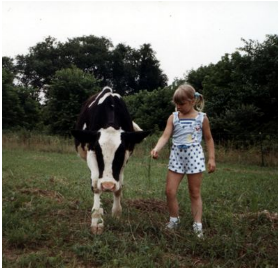
Child with rescued calf (Farm Sanctuary)

We wouldn't need an animal rights movement if society didn't routinely abuse and murder animals to satisfy human desires; but the fact of their enslavement remains. We therefore urge you to learn more and tell others about the animals' plight. Please use the resources in this Guide and contact us if you have any questions or want additional information. On behalf of all exploited animals, we thank you for your concern and look with hope towards a brighter future for the planet and all of its inhabitants.