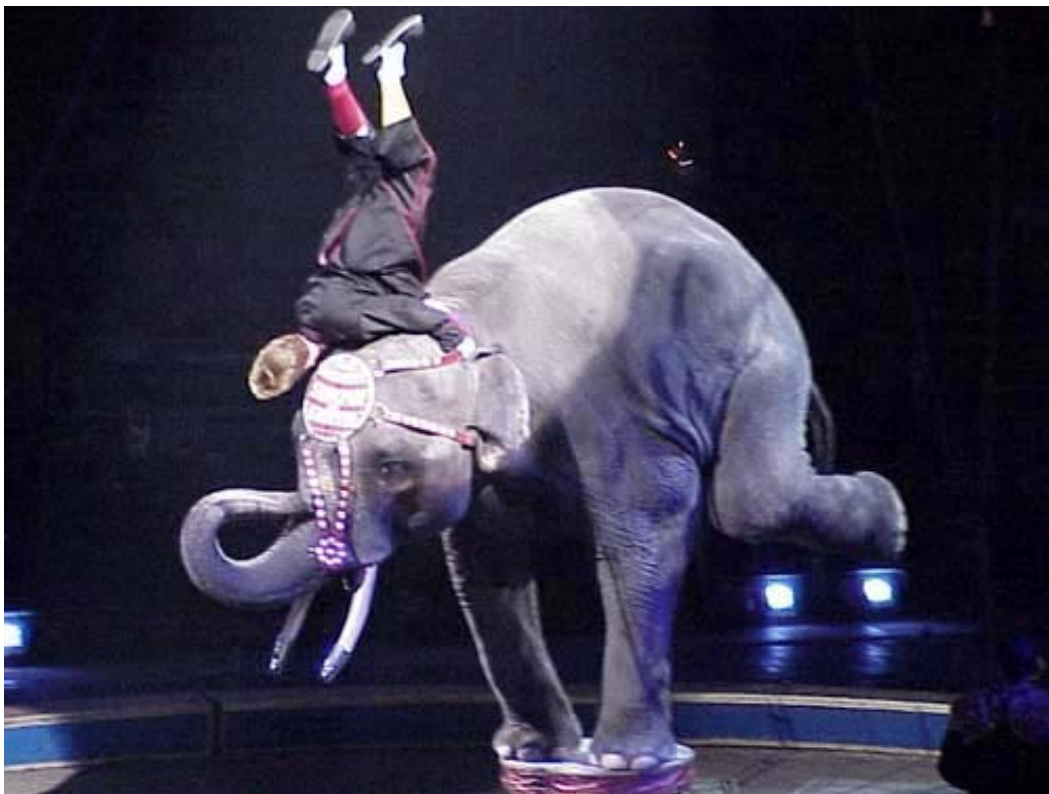
An elephant forced to perform

Circuses - Colorful pageantry disguises the fact that animals in circuses are unwilling captives forced to perform unnatural and often painful acts. From almost constant confinement in cages while traveling to being completely cut off from their families and natural habitats, animals in circuses live in misery. Circus trainers use beatings to train animals to perform their tricks, conditioning them with terror so that they will respond merely out of fear of pain during the show. While circuses try to hide their cruelty from the public by saying they only use positive reinforcement, the standard tools used by trainers—such as choke collars, muzzles, electric prods, and bullhooks—tell a different story. When animals in circuses grow old or sick and can no longer perform, they are sold to zoos, private menageries, game farms (to be hunted as trophies or for their "exotic" meat), or even research laboratories.