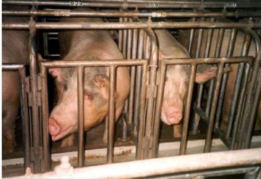
Breeding sows confined in gestation crates

Transport to Slaughter - All animals—whether raised for their flesh or to produce milk or eggs—are eventually turned into meat. Slaughterhouses are often located hundreds or even thousands of miles from the factory farms where animals are raised, so animals are packed as tightly as possible into trains or trucks because it is “economical.” They often make the long journey in extreme weather conditions, many dying along the way from heat exhaustion or sub-zero temperatures. Others who become too sick or injured to walk to slaughter are tossed on a “dead pile” and left to die slowly with other dead and dying animals. Slaughterhouses operate as mechanized assembly lines for the mass murder of frightened animals where they are herded together, shackled upside-down, get their throats slit, and have their bodies dismembered as conveyor belts move them from one station to the next.