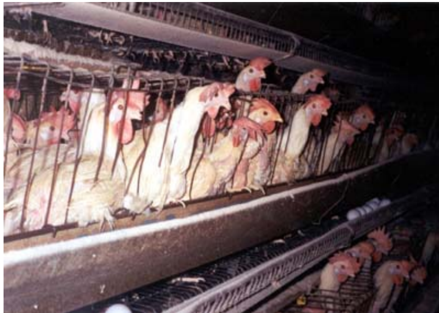
Egg laying hens in battery cages

Egg-Laying Hens - Female chickens raised to lay eggs live their entire lives in wire cages stacked upon one another, packed so tightly together that each hen has only a space about the size of a sheet of paper, not enough room for them to even lift their wings. Confined tightly their entire lives, the chickens often lose most of their feathers rubbing against the metal cages. Debeaking—in which part of the chickens' sensitive beaks are seared off with a hot knife to prevent them from pecking their cagemates to death in the overcrowded cages—is a common practice on factory farms. Battery hens are genetically bred so that each produces approximately 300 eggs per year—about 10 times as much as they naturally would. When they become "unproductive" by these standards, they are either "force molted" (i.e., starved for two weeks) in order to shock them into another laying cycle or sent to slaughter.